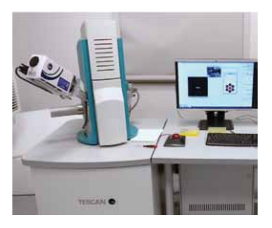
Fig. 1. Scanning electron microscope VEGA II LMU ("Tescan") with an Oxford Instruments INCA Energy 350XT X-ray energy dispersive microanalysis system

The third stage, including the study of the chemical composition and microstructure of the enamel samples surface, was carried out at the Department of Nanomaterial Technology, Engineering Institute, North-Caucasus Federal University. While preparing the teeth for the study, the conventional method was employed: with water cooling and a 0.2 mm diamond disc, enamel was cut at the equator area from the oral and vestibular surfaces of the crowns, to be further treated with ultrasound, degreased, and subjected to vacuum. The chemical composition and microstructure of the enamel surface layer samples was studied in a VEGA II LMU scanning electron microscope («Tescan») with the INCA Energy 350XT X-ray microanalysis system (Oxford Instruments Analytical, England). The samples surfaces were fixed on a glass slide and then sprayed with carbon (h = 12-15 nm) in a VUP-5 vacuum unit for electrical conductivity thus ensuring optimal conditions for microscopy (Fig. 1).