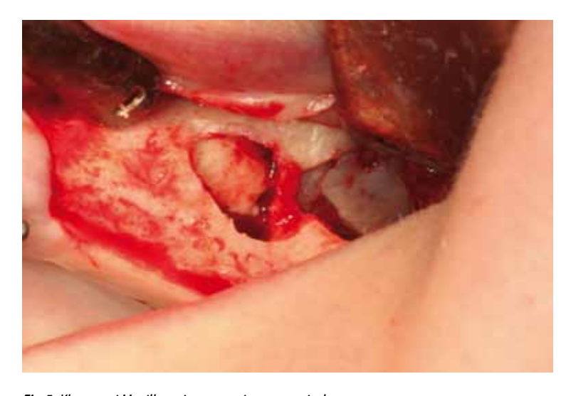
Fig.5. Khorguani Maxillary sinus septa intraoperatively